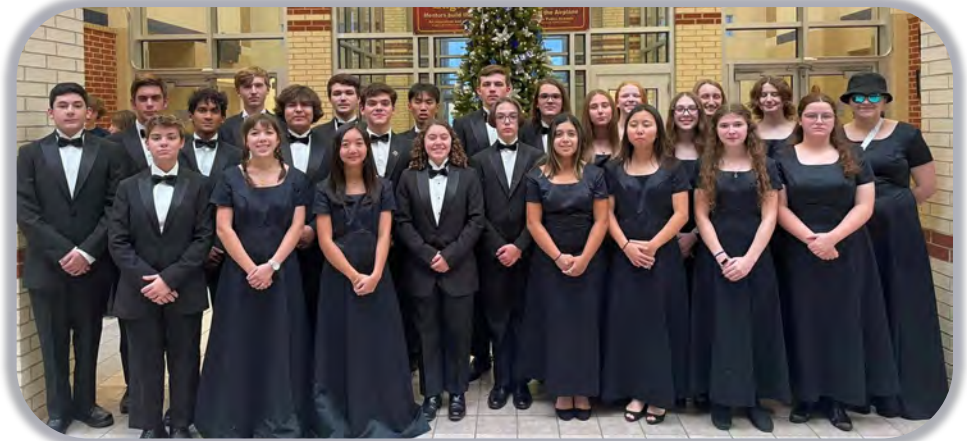
2022 BROOK REGION BAND MEMBERS