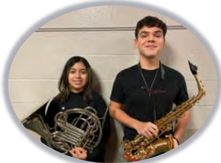
2023 ALL STATERS